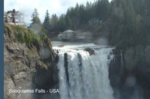
Snoqualmie Falls - USA